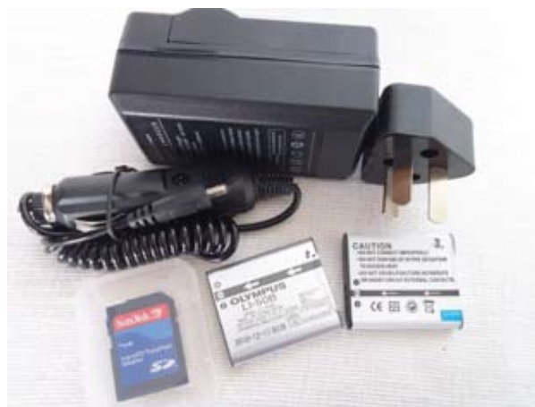
Essential accessories – spare batteries, battery charger for power mains or car cigarette lighter, spare memory card

Apart from the stuff that came with my camera, the other hardware I use is a battery charger that works independently from my camera/ computer. I'm often away from my computer and some times four