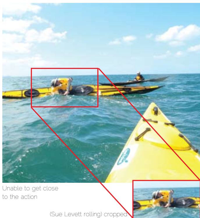
Unable to get close to the action

photo to enhance the subject or make the subject more dominant. Sometimes you just cannot get close enough to the action and need to get rid of surplus foreground, or a stray elbow or boat that somehow